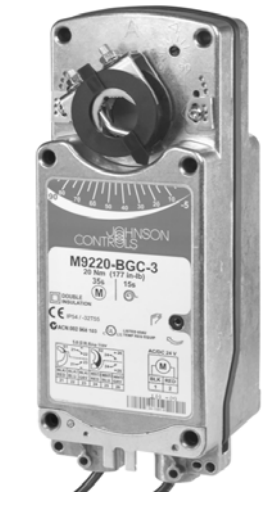
Figure 1: M9220-xxx-3 Electric Spring Return Actuator